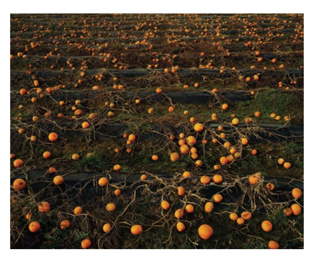
Passchendaele 1917, Goudberg Copse (2005) 28" \times 33"