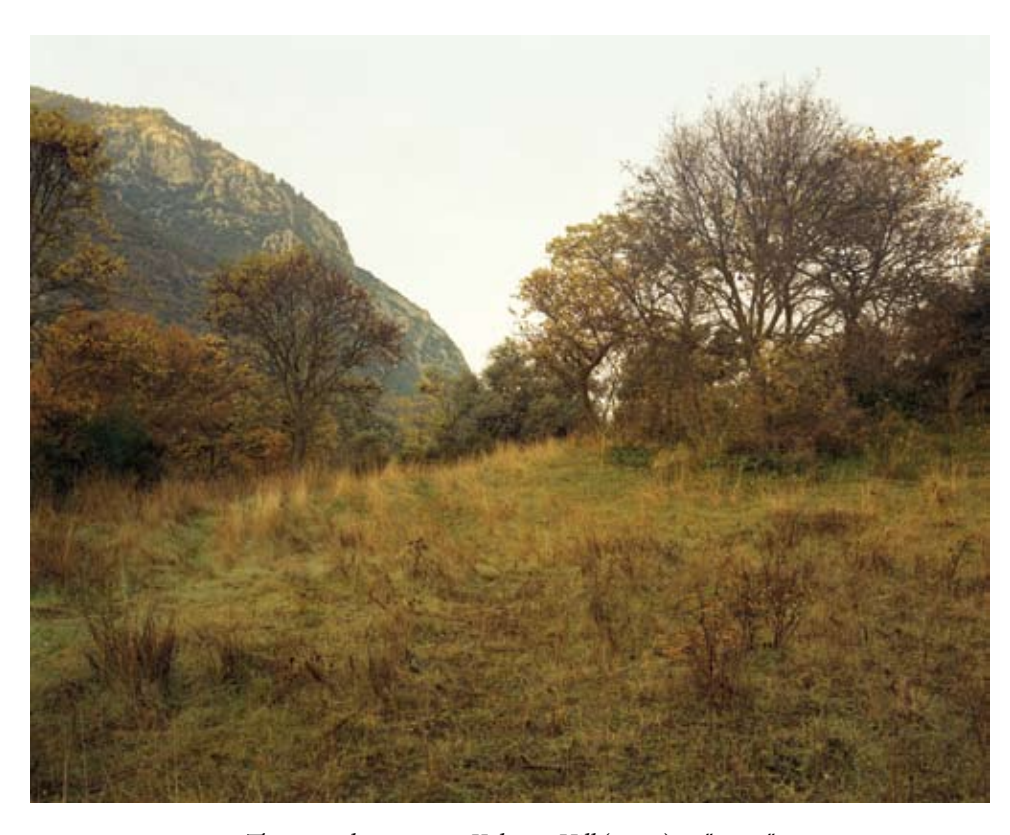
Thermopylae 480 BC, Kolonos Hill (2006) 42" \times 50"