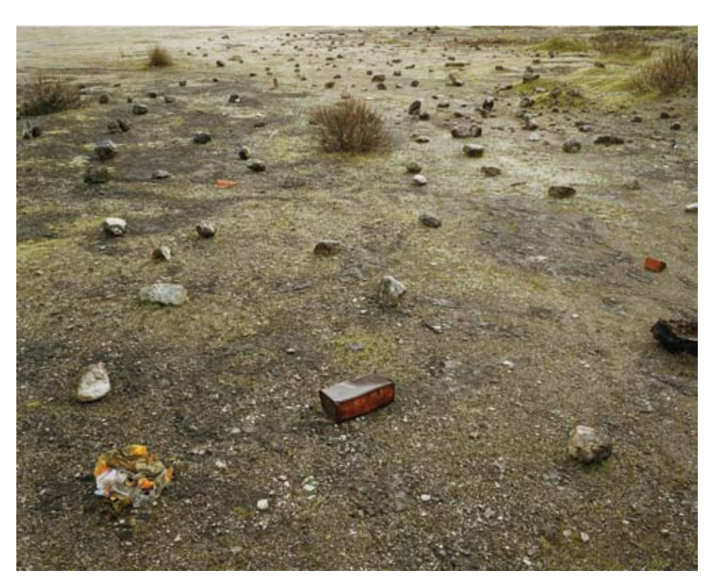
Thermopylae 480 BC, The Death of Leonidas (2006) 42^{\prime\prime}\times50^{\prime\prime}