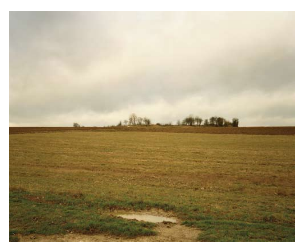
The Somme 1916, Lochnagar Crater (2005) 28^{\prime\prime}\times33^{\prime\prime}