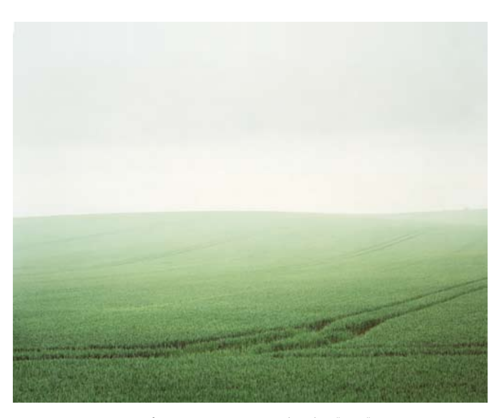
Verdun 1916, Le Mort Homme (2001) 60" \times 72"