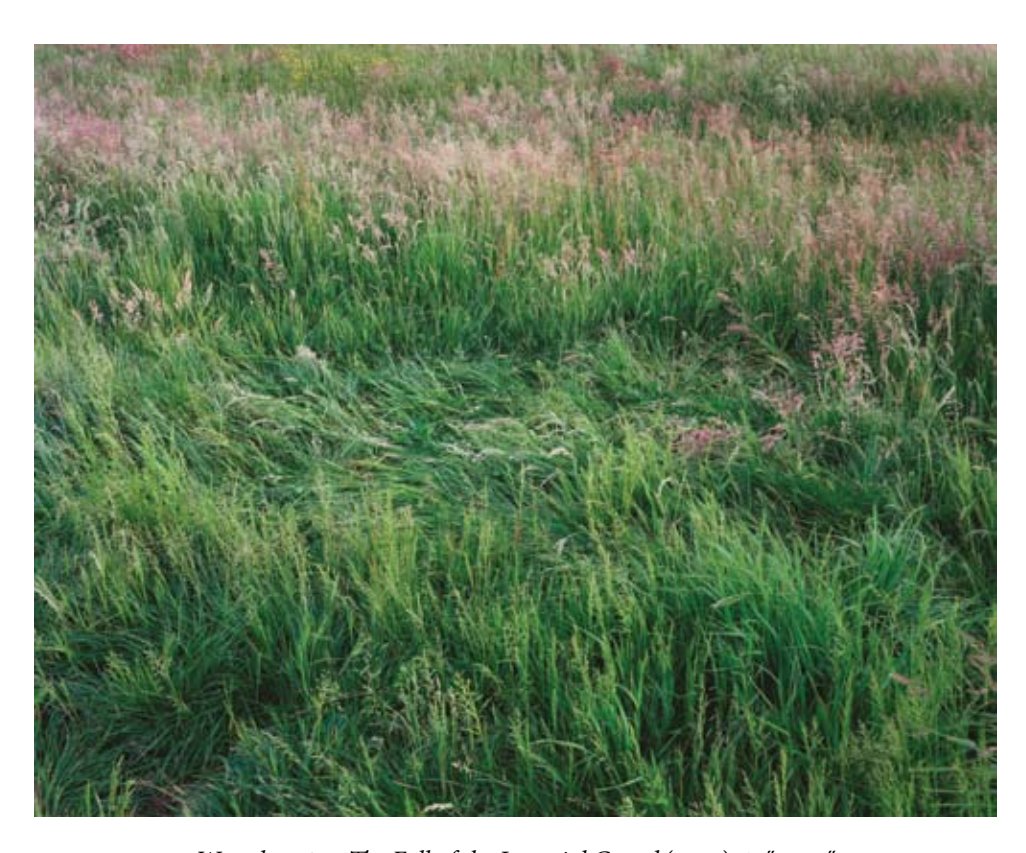
Waterloo 1815, The Fall of the Imperial Guard (2001) 60^{\prime\prime}\times72^{\prime\prime}