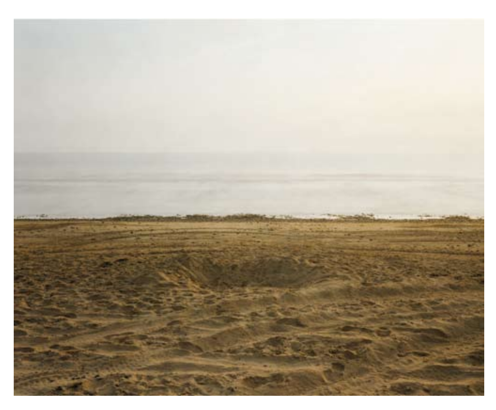
Omaha Beach 1944, Easy Red (2003) 60" \times 72"